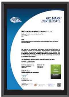
CERTIFIED GREEN COMPANY BY GC MARK GERMANY