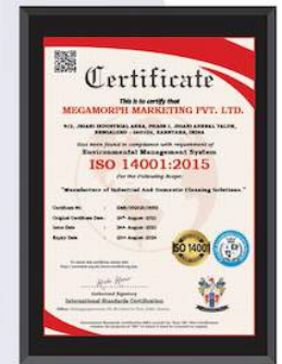
ISO 14001:2015 CERTIFIED ENVIRONMENTAL CONSCIOUS