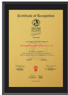
WINNER OF INDIA 5000 BEST MSME AWARD