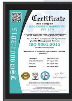
ISO 9001:2015 CERTIFIED QUALITY EXCELLENCE