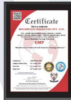
GMP CERTIFIED GOOD MANUFACTURING PRACTICES